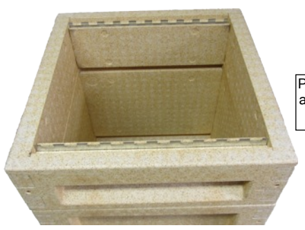
Pic. 3. Behind the frame runner is a slot which will accept castellated frame spacers if required.