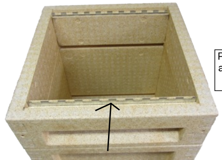
Pic. 3. Behind the frame runner is a slot which will accept castellated frame spacers if required.