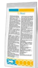
Bag 175g for 50 beehives*