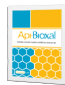
Bag 35g for 10 beehives*