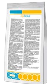
Bag 350g for 100 beehives*

*Considering 10 frames full of bees (administration by trickling)