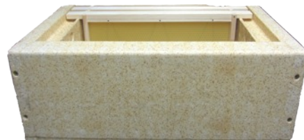
Pic. 2. You can see the Poly frame runner which gives you space to pick up the frame and should be opposite each other when assembling.