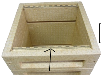
Pic. 3. Behind the frame runner is a slot which will accept castellated frame spacers if required.