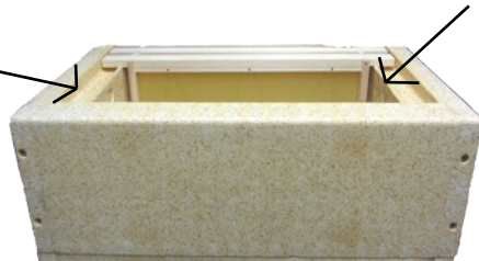
Pic. 2. You can see the Poly frame runner which gives you space to pick up the frame and should be opposite each other when assembling.