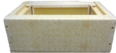
Pic. 2. You can see the Poly frame runner which gives you space to pick up the frame and should be opposite each other when assembling.