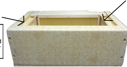
Pic. 2. You can see the Poly frame runner which gives you space to pick up the frame and should be opposite each other when assembling.