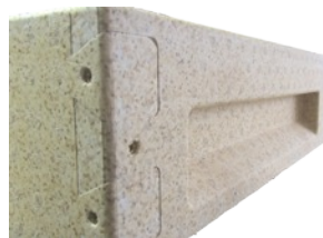
Pic. 1. You can see the rounded edges at the top with the hand holes pointing out and down to disperse water.