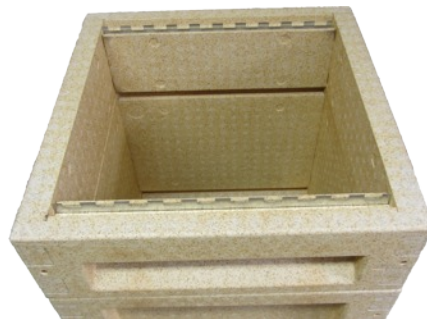
Pic. 3. Behind the frame runner is a slot which will accept castellated frame spacers if required.