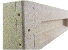
Pic. 1. You can see the rounded edges at the top with the hand holes pointing out and down to disperse water.